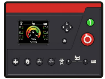
Figure 1: AMF-L Front side view