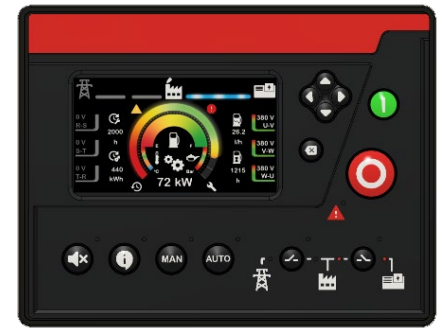
Figure 1: AMF-L PRO Front side view