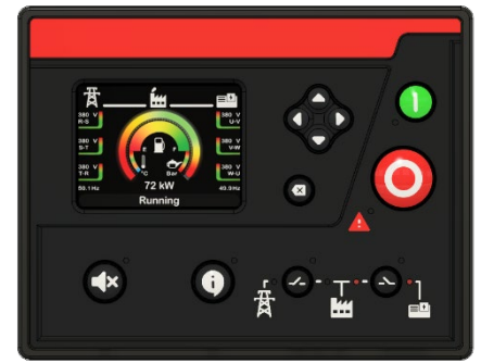
Figure 1: AMF-M Front side view